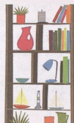
not many books

We use much + noncount noun ( much food / much money , etc.):