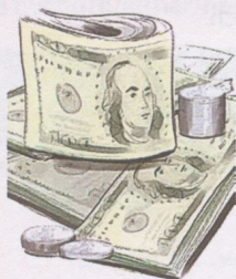
a lot of money