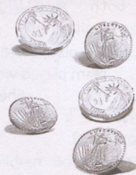
not much money